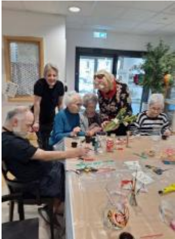
Visit to Rochdale. Craft Activities at Railway Bridge View.