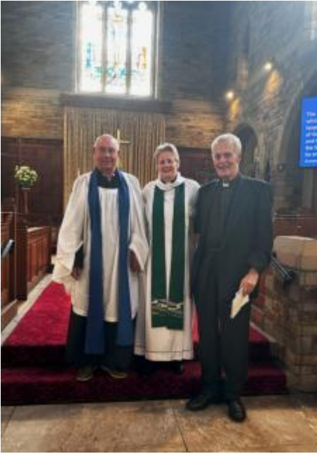
Celebration of 75 years of Ministry