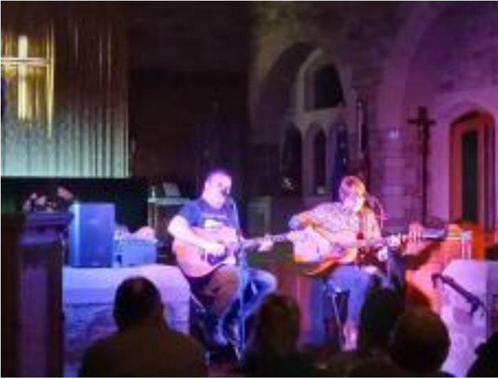
'Celebration of Simon & Garfunkel'