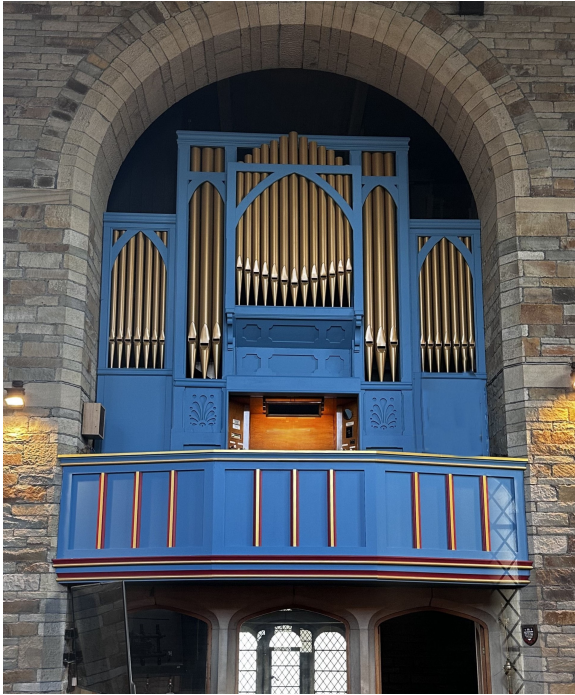
Refurbishment of the organ