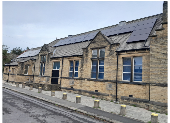
Solar panels on the hall roof